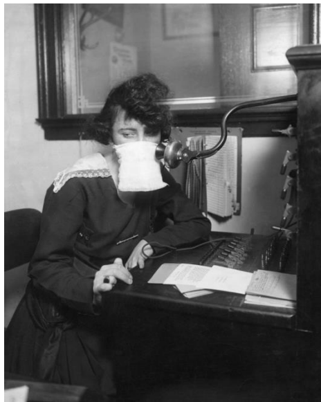
A telephone operator with protective gauze

Here are some pictures from BBC.com featuring the Spanish flu in 1918.