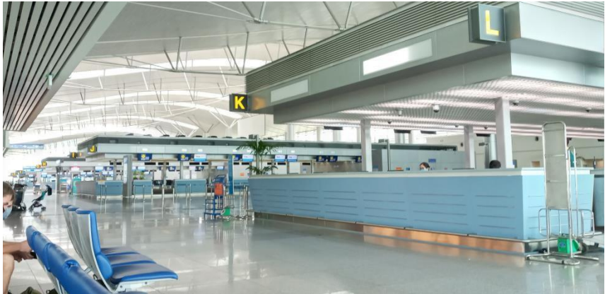
Figure 2: Virtually empty Ho Chi Minh Airport when I was there for my Phnom Penh flight

So I went to the virtually empty airport of Ho Chi Minh. The taxi driver was really shocked about the weird look of the place as it was like a ghost airport. I think there were only about 10 people I saw inside the airport that include the guards, money changer staff, some passenger, and flight attendants in the check in counters.