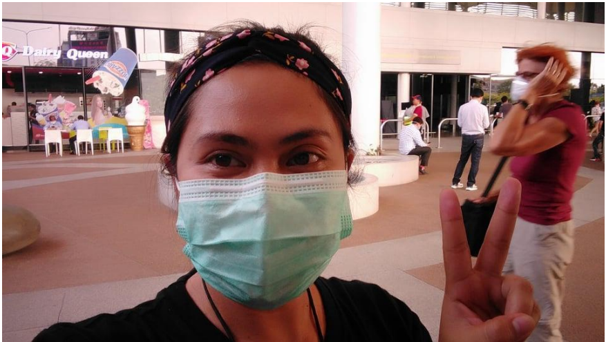
Figure 3: Upon arrival at Phnom Penh International Airport

I had an opportunity to talk to him because he was asking for help in filling out his arrival card, health cards, etc.. I was amused by the suits of the other Chinese people in the plane who almost like wearing PPEs while I was just wearing a one-dollar worth of mask and a fashion headband. Upon arrival in Cambodia, I felt relieved. I cannot explain the feeling of being released from a very dark tunnel. That was one of the best days of my life and I could really define the word “freedom” by what I have experienced. Passing through the immigration was almost seamless; there was not a lot of questions or even lab tests. They just let me in.