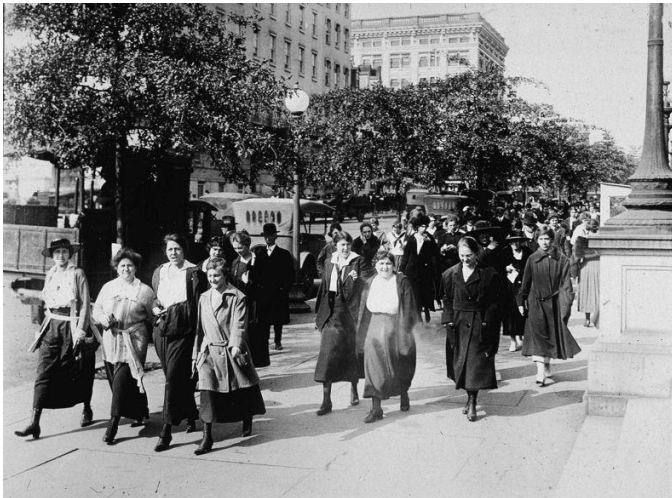
Women from the Department of War take 15-minute walks to breathe in fresh air every morning and night to ward off the influenza virus during World War I, c. 1918.