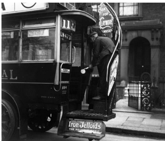
A man sprays a bus of the London General Omnibus Co, with anti- flu preparation in March 1920.