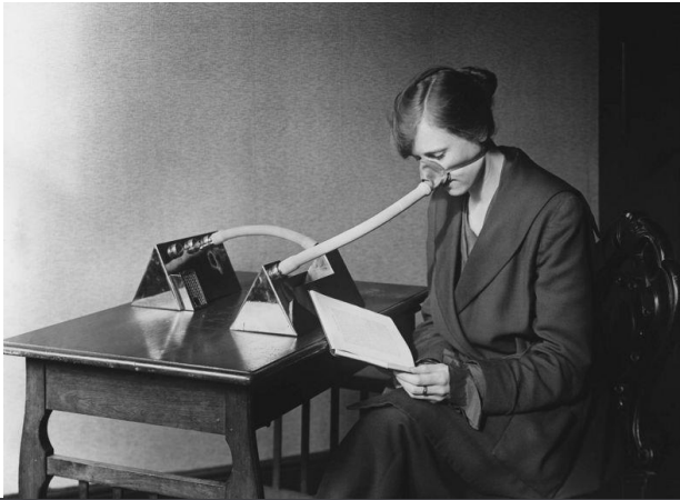
A woman wears a flu mask during the Spanish flu epidemic