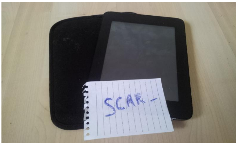
7" Tablet, I do my eReading on this thing.