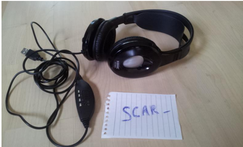
Chinese Headset, I use it on Skype.

What's a method without proof? Worthless. Here are some recent items I have received by using my niche.