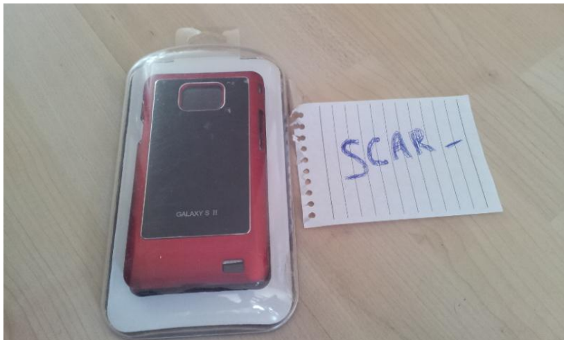
Samsung Galaxy SII Phone Case – It protects my phone